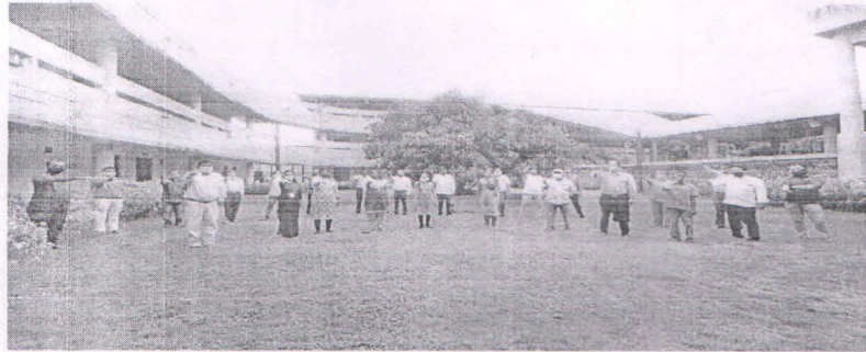
Staff Taking Earth Pledge

NSS department of Sindhudurg Shikshan Prasarak Mandal's College of Engineering , Kankavli had celebrated "Mazi Vasundhara Diwas" Earth Pledge on 05 th January 2021.