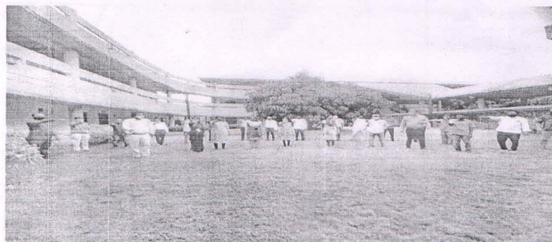
Staff Taking Earth Pledge